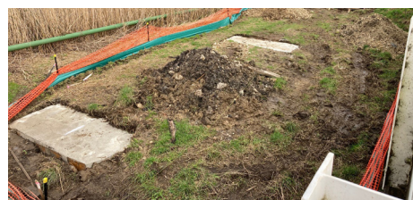
Campbells Creek bridge footings