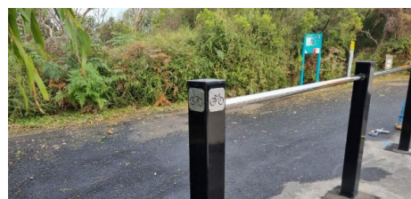
Bike rack, Great Ocean Road Carpark Lookout