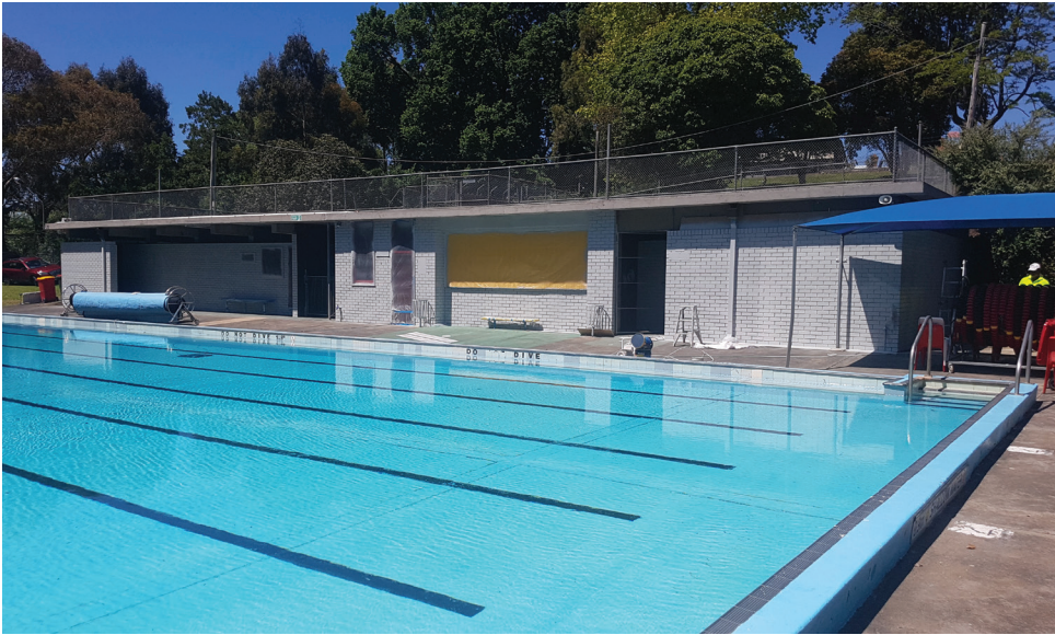
The Cobden outdoor pool pavillion has received a fresh coat of paint.