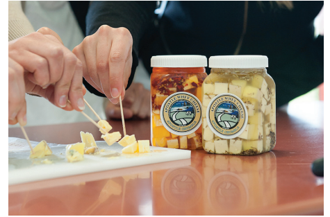
Clockwise from left: Mount Noorat, Lake Purrumbete, Lake Tooliorook, GORGE Chocolates, Newtons Ridge, Apostle Whey Cheese, Berry World Timboon, Lake Bullen Merri, Stewart Park Skipton