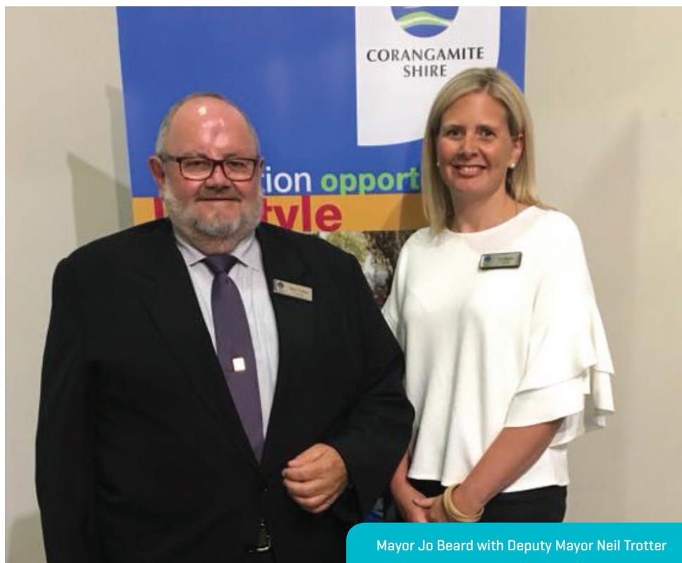
Mayor Jo Beard with Deputy Mayor Neil Trotter