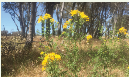
St John's Wort