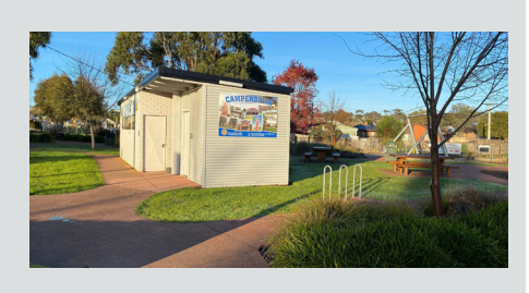
Apex Park, Camperdown Toilet and access upgrades