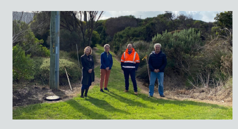
New walking track Port Campbell