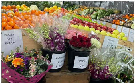
Jason and Cassie Greaves have transformed Greavesy's into a 'go to' destination for food lovers.