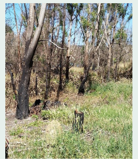
Lake Bullen Merri vegetation after treatment, January 2019

Take an aerial tour of Corangamite Regional Landfill via our YouTube channel.