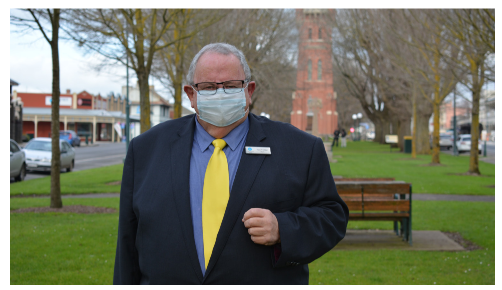
Mayor Neil Trotter