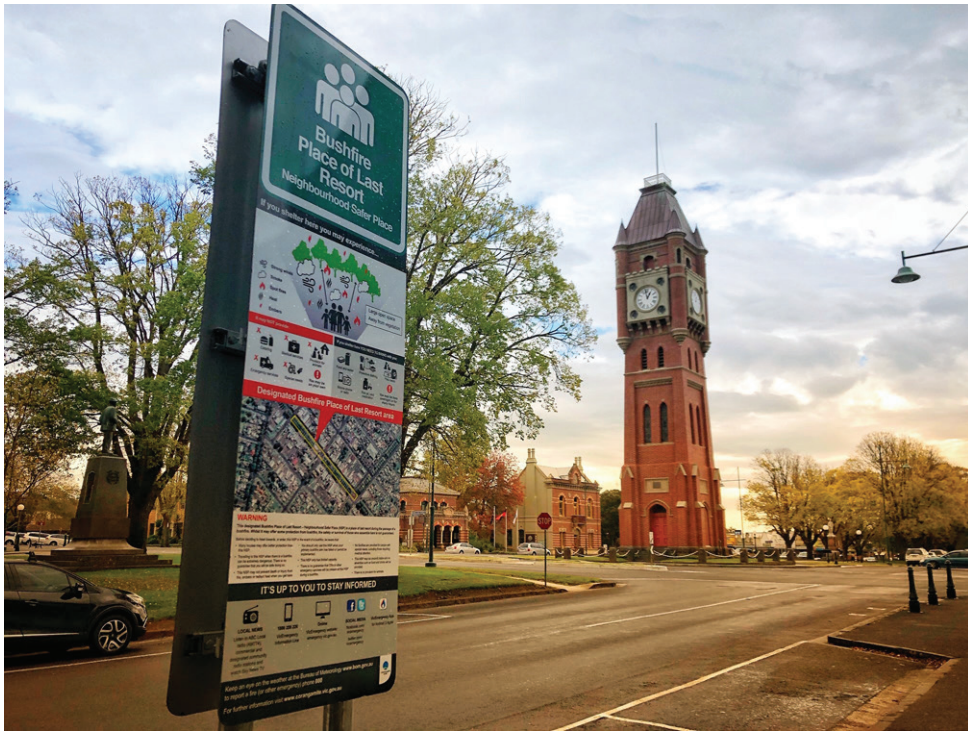
Bushfire Place of Last Resort, Camperdown