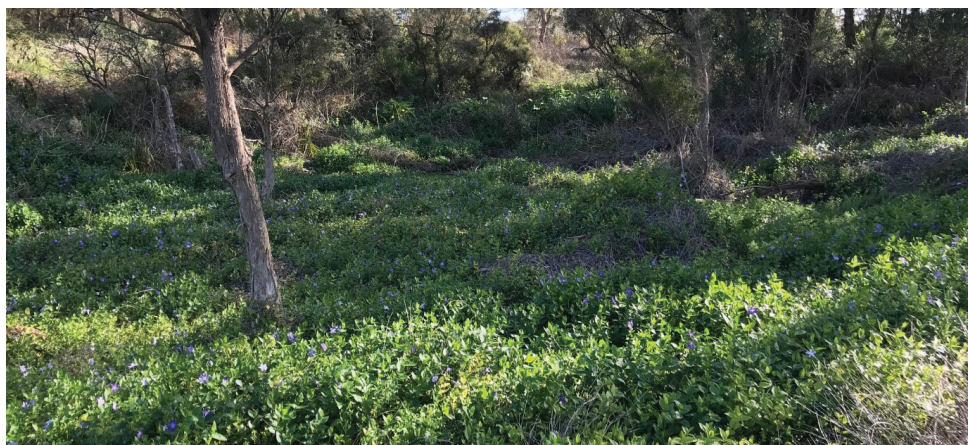
Blue periwinkle on East & West Road, Timboon

Have you noticed less weeds along our local roadsides? (Not arterial roads – this is a Regional Roads Victoria responsibility).