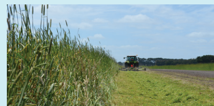
Slashing, first pass.

The annual Community Satisfaction Survey tells us that keeping our roadsides clear is a service our residents want us to improve. The program has been revitalised to improve road safety and fire prevention.