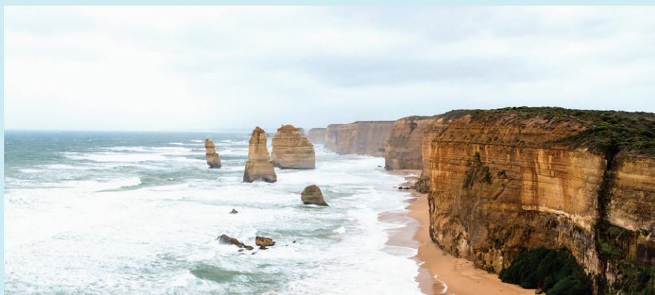
12 Apostles, Great Ocean Road.

Great Ocean Road Regional Tourism is calling on residents to invite people they know to visit our region.