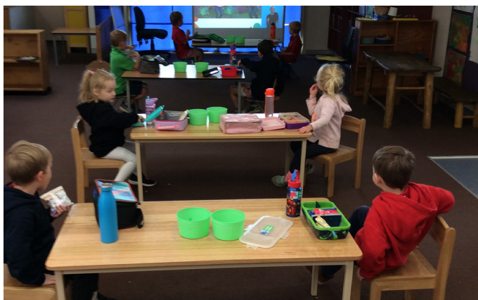
Social distancing at Simpson Kindergarten.

Term Two has resumed and we are in a new world of COVID-19. We had lunch with social distancing while watching the Covid-19 episode of Play School .