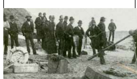
The Rocket Rescue Crew attend the 'Fiji', 1891

Port Campbell's port directly fronts the Southern Ocean. The location is renowned for its extreme sea conditions and frequent early maritime disasters, sea rescue and salvage as its rugged cliffs are situated at the 'Eye of the Needle' – the narrow entrance to one of the world's most notorious and treacherous stretches of sea, Bass Strait.