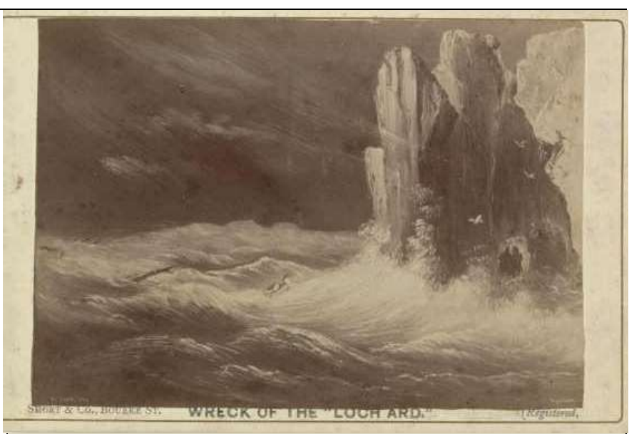
'Wreck of the Loch Ard'

There are 638 known shipwrecks along Victoria's coast, with around 240 being located and registered. These include The Thistle (1837), The Children (1839), Lydia and Socrates (1843), and The Enterprise (1850). With the migration following the opening of Victoria's Gold Rush, more and more ships came, the ill-fated yielding up their human cargo to the sea on the very cusp of their long journey's end. This terrible history was instrumental in shaping the development of the Port Campbell.