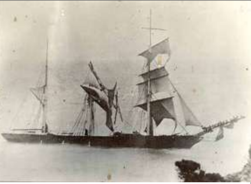
The wreck of the 'Fiji', 1891

The port was originally developed as a result of one of Australia's worst maritime disasters, the wreck of the Loch Ard in 1878.